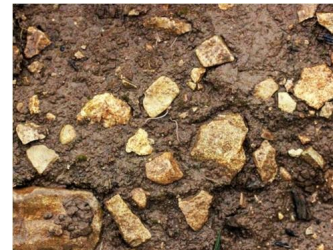
Top: Frédéric Touzot. From left to right: 1) the rolling hills of the northern Maconnais favor ripening and complexity. 2) The south-facing, warm Les Parettes site with stony soil. 3) The superbly exposed Les Cras slope. 4) Red-brown, stony limestone-clay soil warms quickly and drains well.