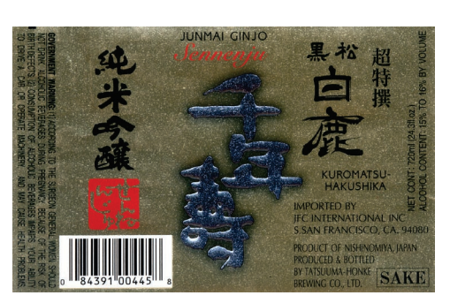
Product: Chotokusen Sennenju Classification: Junmai Ginjo

Great fragance of fruity flavor, delicate sweetness, rolls down the throat smoothly, with a gentle body.