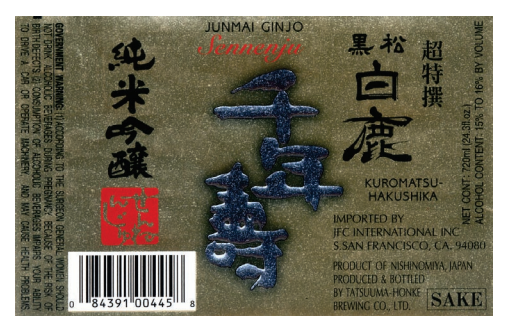
Product: Chotokusen Sennenju Classification: Junmai Ginjo

Great fragance of fruity flavor, delicate sweetness, rolls down the throat smoothly, with a gentle body.