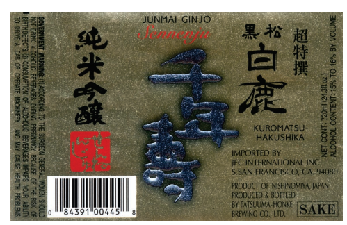
Product: Chotokusen Sennenju Classification: Junmai Ginjo

Great fragance of fruity flavor, delicate sweetness, rolls down the throat smoothly, with a gentle body.