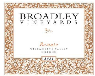
2021 PINOT GRIS ROMATO WILLAMETTE VALLEY

Lovely Apricot color -on the nose orange blossoms. Medium bodied with refreshing citrus flavors and a hint of white peach. Well balanced with good acidity. Skin contact for 3 days, fermented dry and aged in neutral French Oak for 7 months.