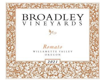
2021 PINOT GRIS ROMATO WILLAMETTE VALLEY

Lovely Apricot color -on the nose orange blossoms. Medium bodied with refreshing citrus flavors and a hint of white peach. Well balanced with good acidity. Skin contact for 3 days, fermented dry and aged in neutral French Oak for 7 months.